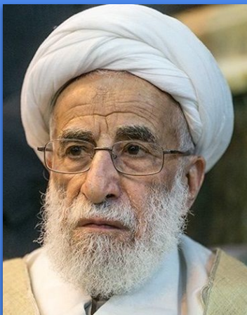
Ayatollah Ahmad Jannati