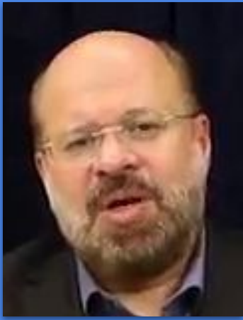
Khaled Qaddoumi ( Hamas )