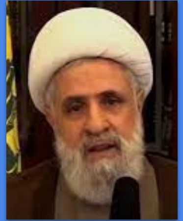
Naim Qassem ( Hezbollah )